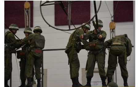
Doing the Airborne drills in the swings

One of the hardest parts of the course was trying not to over stress the basic commands. If you made a mistake or did not follow the proper command you would be put into push up position and have to pump out 25 and then 5th point of flight procedure. It sucked but I toughened up and stuck to it so did my peers and we all helped each other out and was a team effort.