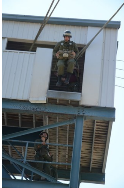
Jump Tower exit drills

After that my next 4 jumps were awesome and I felt no fear at all. My night jump was the scariest because it was complete darkness and I braced myself for the ground. In what seemed like a split second, the ground appeared out of nowhere and I hit the ground hard. It hurt a little bit, but I brushed it off; feeling exhilarated in having successfully completed my night jump.