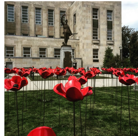
551 veterans from Huron County lost their lives in WWI. 551 ceramic poppies were made by local artists and placed on display in front of the Goderich Cenotaph