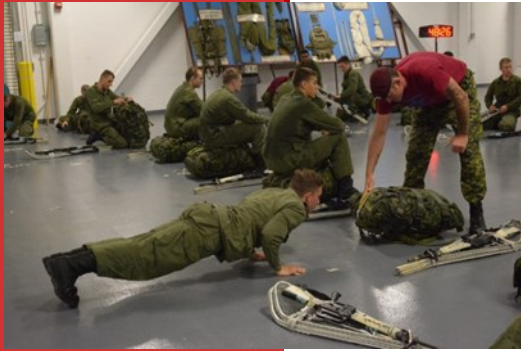
Fitness and push-ups emphasized

One of my greatest achievements was taking part in the basic parachutist course this past summer. I've always wanted my "wings" since joining cadets and seeing my past RSM and DSM achieving this really pushed me to get my wings even more.