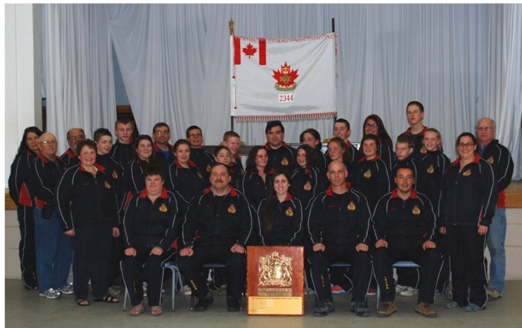
Pictured with their new attire and the Stratcona Award of Excellence are New Liskeard 2344 Royal Canadian Army Cadets, Algonquin Regiment

"We are very proud to be part of this amazing team and hope to see continued growth in the upcoming years".