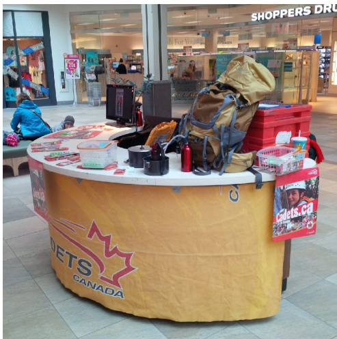
2919 RCACC Barrie stand of promotional materials at the Georgian Mall in Barrie, ON

There was a lot of interest from the community. People came to the stand to reminisce about their time in the Cadet program. It was great to hear the impact that the program had on the lives of others. The Corps also had a lot of interest from youth wishing to participate.