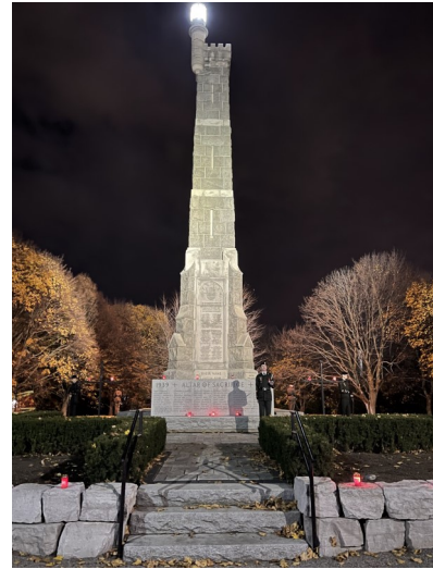
Cadets at the Cenotaph

On November 5th, 2022, a group of our Cadets went to the Aurora cenotaph and took turns from 6PM to 11PM in a candle-lit vigil to remember our fallen heroes. A handful of our Cadets also assisted at a Poppy dinner held at the Aurora Royal Canadian Legion Branch 385 with the 140 Aurora Squadron RCAC to support the legion and assist with their Remembrance Day observances.