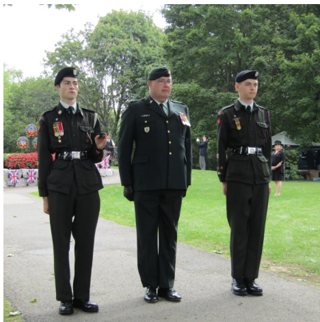
Cadets at the Memorial Ceremony