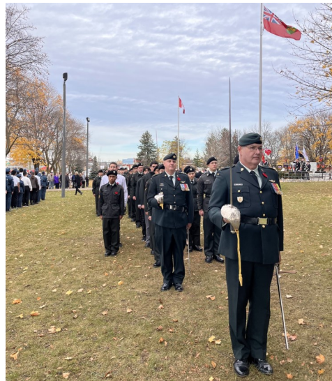
Cadets on Parade