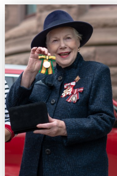
Lieutenant Governor of Ontario was presented with the Army Cadet League medal