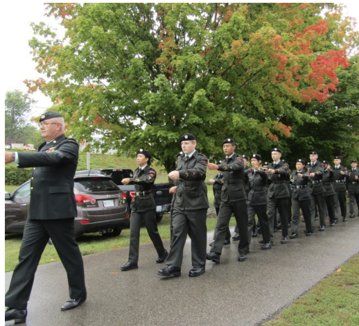
Cadets at the Drumhead Service

The 2799 Queens York Rangers Army Cadet Corps has had a lively and absolutely amazing year of training so far. With much more to come, everything we have done in the past couple of months has allowed our Cadets to develop and become the leaders of tomorrow. Whether it be volunteering, giving back to the community, participating in different summer training exercises or showing an admirable amount of dedication and discipline to better themselves in any way that they can, our Cadets have done and continue to do so much for themselves and the Cadet program in general. We participated in a couple of really special ceremonies in the past couple of months.