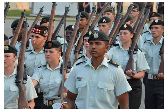
Alpha Company during Sunset Ceremonies