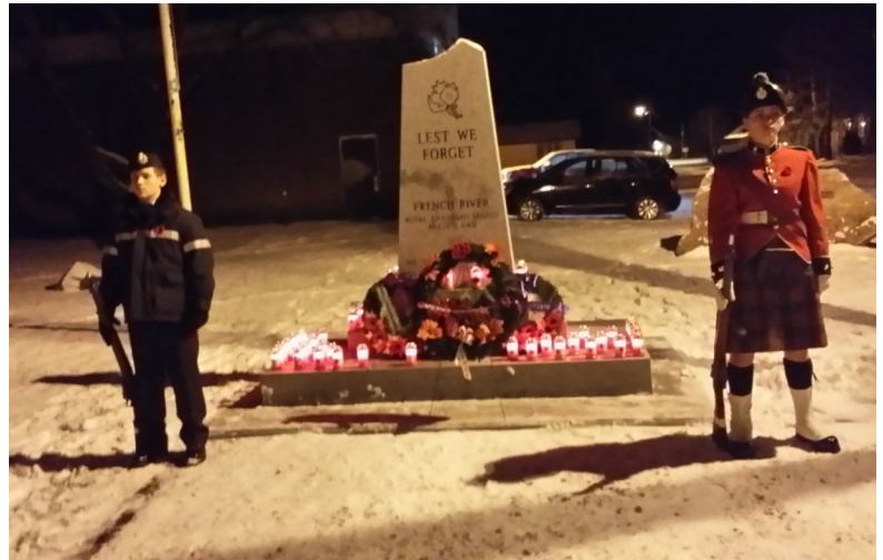
Cadets from 2912 RCACC French River stood vigil at their local cenotaph for Remembrance Day