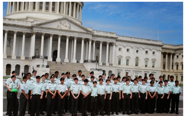
The Corps celebrated their 60th anniversary with a trip to Washington, DC