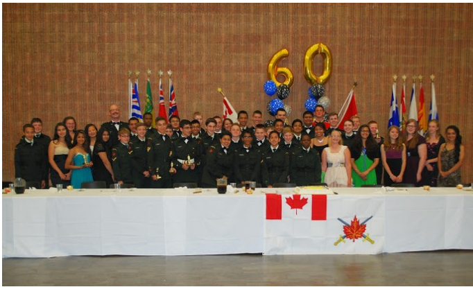
Above: 2525 RCACC Pickering at their Celebratory Dinner at the Pickering Recreation Complex, June 7, 2014

This year marked the 60 th anniversary of the 2525 Ontario Regiment Cadet Corps. As a way of celebrating the corps anniversary, the 2525 Ontario Regiment Cadet Corps staff and cadets hosted a garrison parade at the Don Beer Arena in Pickering on June 1, 2014 and a celebratory dinner at Pickering Recreation Complex on June 7, 2014.