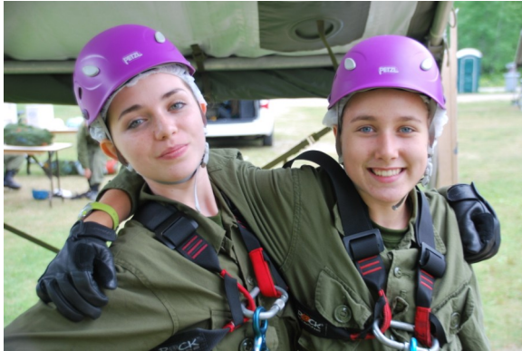
General Training Cadets making friends and abseiling