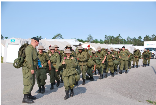
General Training Cadets returning from the field