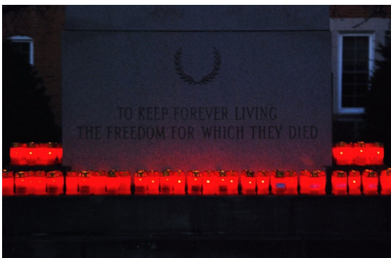
2360 RCACC Arnprior first Memorial Candle Walk. The Cadets and staff sold Memorial Candles as a fundraiser initiative. The Cadets stood vigil until 11: 30 pm on Nov 10, 2014 and then attended the Parade on Nov 11, 2014