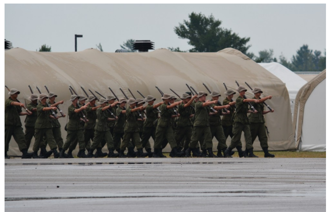
Alpha Company marching on parade