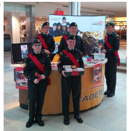
2919 RCACC Barrie stand of promotional materials at the Georgian Mall in Barrie, ON

There was a lot of interest from the community. People came to the stand to reminisce about their time in the Cadet program. It was great to hear the impact that the program had on the lives of others. The Corps also had a lot of interest from youth wishing to participate.