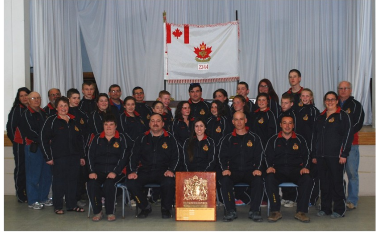
Pictured with their new attire and the Stratcona Award of Excellence are New Liskeard 2344 Royal Canadian Army Cadets, Algonquin Regiment

"We are very proud to be part of this amazing team and hope to see continued growth in the upcoming years".